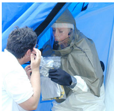
Put victim's personal items in a labeled plastic zip bag.

All of the steps above can influence the extent of healthcare workers' exposure to the contaminant. However, certain steps should be highlighted for their direct impact on the concentrations of contaminant first receivers will encounter. For example, disrobing might remove as much as 75 to 90 percent of the contaminant arriving on a victim (Macintyre et al., 2000; Vogt, 2002; USACHPPM, 2003a). 69 By isolating (in an approved hazardous waste container) the contaminated clothing, staff prevent these materials from off-gassing into the work area. To minimize first receiver exposure levels, these steps should be implemented immediately as victims arrive.