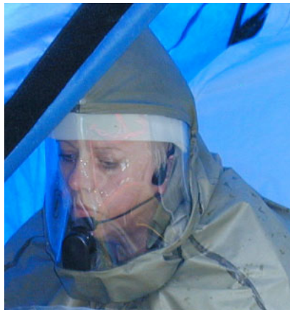
"Temple-transducer" style two-way radio headset stays in place under PAPR hoods.

Hospital A uses two-way headset radios to communicate with and monitor the health status of individuals who are wearing hooded PAPRs and protective suits in hot weather. This hospital found that a behind-the-head "temple transducer" style headset is more practical under PAPR hoods than "over-the-head" models, which tend to dislodge and are difficult to reposition without removing the hood.