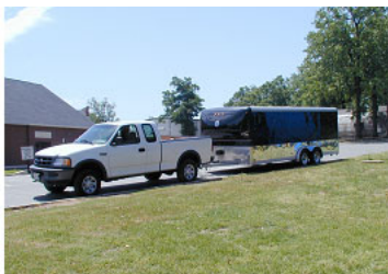
Although permanent decontamination systems have many advantages, portable facilities can be transported to other locations, if necessary.

Hospital A, which trains other hospitals to offer decontamination services, notes that it is critical to match the decontamination equipment purchased to the needs of the hospital and the community it serves. Hospital advisors recommend that any hospital with an emergency room should be prepared to decontaminate victims. However, facilities such as long-term care facilities and specialty clinics do not necessarily need decontamination capability. A hospital with a minimal risk of receiving multiple contaminated victims should consider acquiring a small system that can be handled by a few employees. 67 According to Hospital A, "every hospital should have a well-coordinated plan for arranging [timely] decontamination of any patients who may show up at the door, without putting staff at undue risk." The plan should include medical triage and treatment capability with proper precautions.