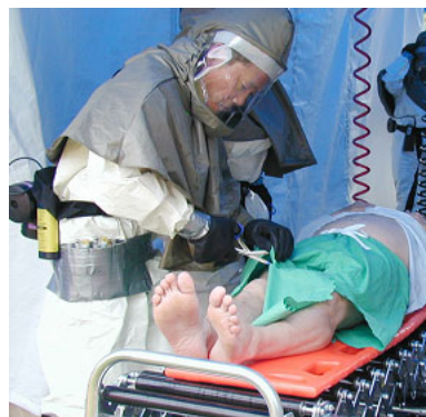
Use blunt scissors to cut away clothing. Avoid stretching or wringing cloth.

Non-ambulatory victims can require a substantial proportion of first receivers time and efforts. First receivers are likely to experience the greatest exposures while assisting these victims. Staff should take steps to identify possible sources of contamination and limit their exposure to those sources. For example, Hospital A uses specific procedures for removing victims clothing to minimize first receiver and victim exposures. Assistants use blunt-nose scissors to cut away clothing, rather than pulling it off. Tugging on clothing can produce a wringing action that might distribute contaminant on the victim, healthcare workers, and the surrounding area. Once removed, the clothing is immediately placed into a sealed container.