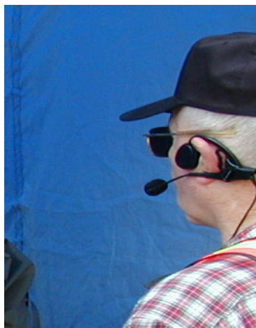
Detail of "temple-transducer" style radio headset.