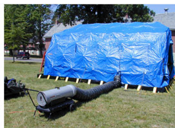
A blower can increase fresh air circulation the decontamination system. In cold weather, the unit shown also heats air to a comfortable temperature.

Because of the time it takes first receivers to put on PPE and to set up decontamination facilities, hospitals may want to consider arranging for alternate rapid forms of decontamination until more sophisticated decontamination facilities are up and running. For example, some hospitals use high capacity, low-pressure hoses or showerheads, connected to high capacity, temperature-controlled water sources. These hoses and showers allow rapid preliminary drenching of multiple victims. Where multiple shower heads can be activated, ensure that the available water flow into, and through, the system is adequate to provide rapid decontamination at each shower head. 68