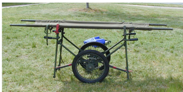
Hospitals can obtain military surplus equipment to supplement the decontamination facility supplies. (Shown here: A field stretcher for transferring non-ambulatory victims from arriving vehicles to the decontamination facility.)

Hospitals A through G report that they considered the following factors when evaluating their decontamination system options: