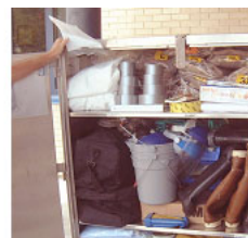
Staff can quickly move wheeled equipment carts from storage to the staging area.

Long-term maintenance of battery-powered respirators, such as PAPRs, creates a special challenge. The batteries should be kept fully charged and should be maintained according to the manufacturer's directions. The respirator manufacturer's specific recommendations for charging, testing, and expected battery service life should be considered in any effort to maintain future readiness. Lithium-based batteries might offer more reliable long-term service. However, hospitals should discuss the relative merits and maintenance of the available batteries with the respirator manufacturer.