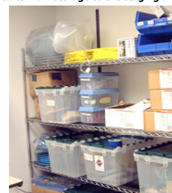
A storage room near the ED door offers convenient access for first receivers' supplies.