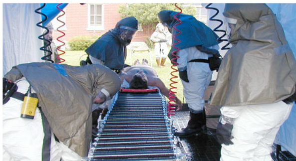
A roller system platform helps move non-ambulatory victims on backboards through the decontamination facility.