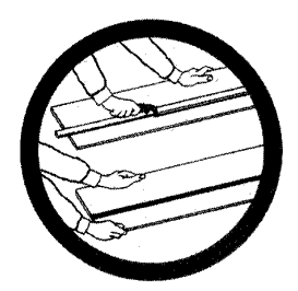
Cutting asbestoscontaining wall board by hand.