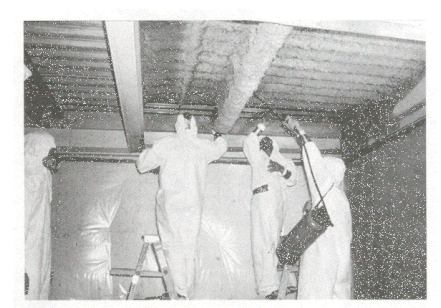
Typical high risk abatement project