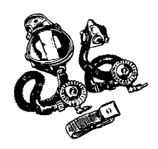
Supplied air respirator

These respirators provide breathable air from an external air source through an air hose connecting the air source to the breathing mask. They can provide protection against higher levels of airborne contaminants than can air purifying respirators. Air supplied to the respirator must meet the requirements of CSA Standard Z180.1-00 Compressed Breathing Air and Systems .