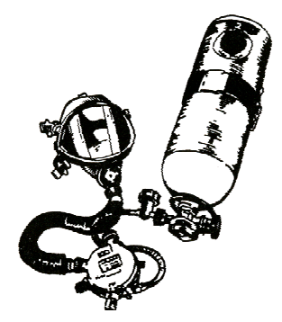
Self-contained breathing apparatus (SCBA)

The air supplied in this system is contained in a cylinder which the wearer usually carries on the back. The wearer's air is completely independent of the ambient atmosphere. SCBAs are used in areas where very high levels of protection are required. SCBAs may not be practical for the majority of asbestos abatement projects.