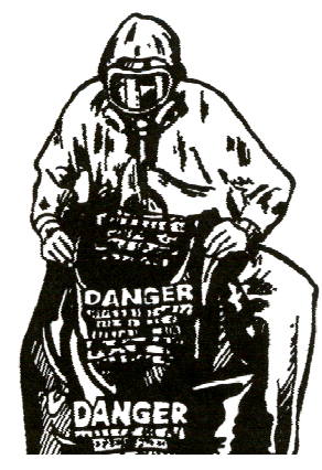
Waste bags should be properly labelled

Asbestos waste, including contaminated disposable clothing, must be placed in sealable containers that are labelled as containing asbestos waste. Containers of asbestos waste must be sealed and external surfaces cleaned by wiping with a damp cloth that is also to be disposed of as asbestos waste, or by using a vacuum cleaner fitted with a HEPA filter. The cleaned containers must then be removed from the work area.