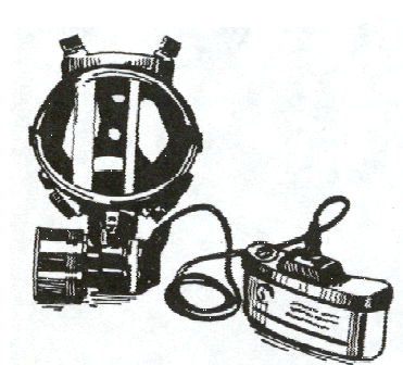
Powered air purifying respirator equipped with P100 filters

Filters used for asbestos fibres must be high efficiency (99.97 per cent) as classified by NIOSH. NIOSH approves three types of high efficiency particulate respirators — N, R and P. N class respirator filters may only be used where the work area is free of oil. R class filters are oil resistant and can only be used