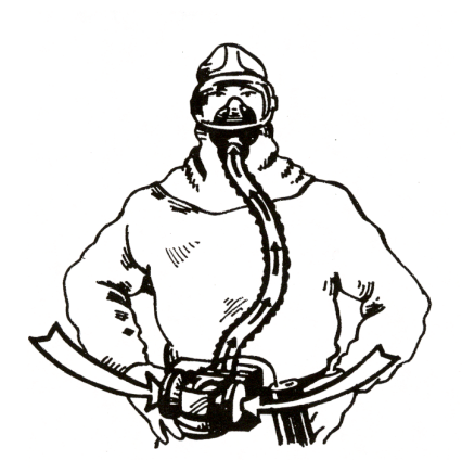
Protective equipment required for high risk activities

The wearing of disposable coveralls is recommended. Street clothes must not be worn under disposable coveralls.